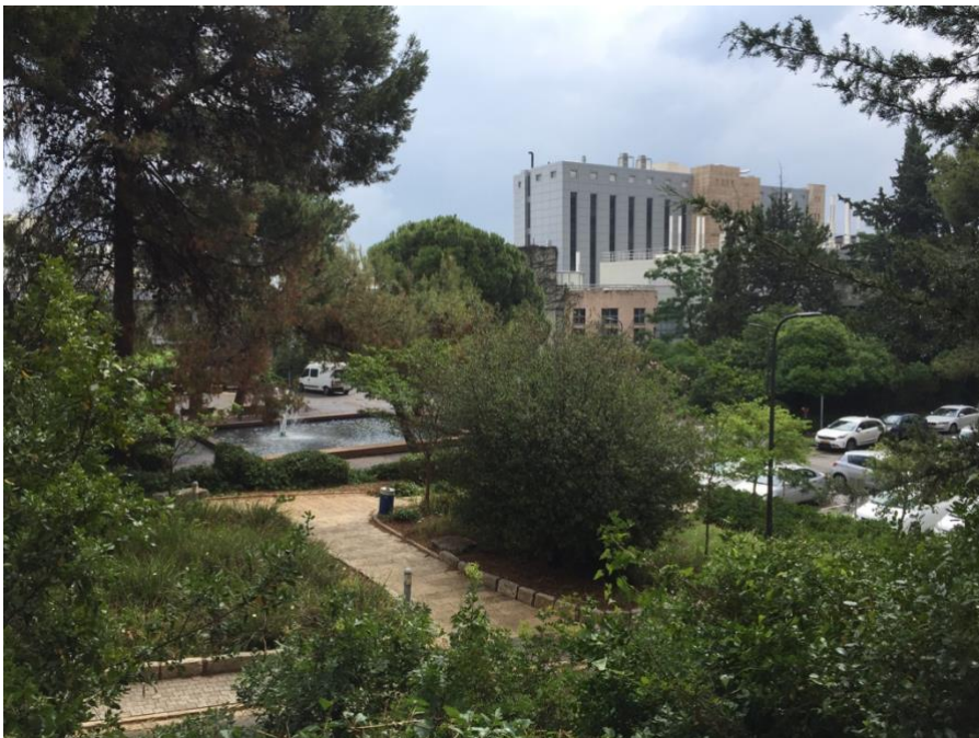
The campus of the Technion.

My experience in Israel this summer left me excited about the possibility of spending time doing research in Israel, specifically at the Technion in Haifa. Though I had fallen in love with Jerusalem before, this summer I was exposed to Israel's multifaceted geography and cities, learning about sides of this fascinating country I had never heard of. As I decide how to spend the time after my graduation, I am glad to have the option of spending a year in Haifa, doing research alongside world-class researchers in an exciting field. Israel specifically is an exciting place to be a researcher, as recent investments in research mean that scientists can take large steps forward as they catch up to more established groups in Europe and the US. In Jerusalem I learned about living in Israel as a foreigner, an experience which would be dynamic and fascinating, bringing its own challenges and barriers as well as opportunities to grow as an individual.