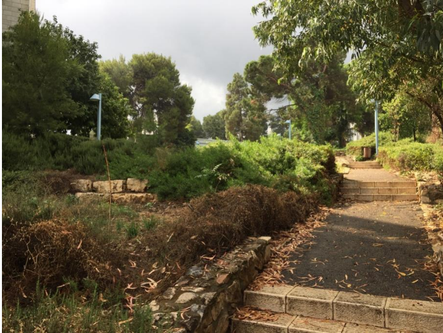
Walking through rosemary bushes and overgrowth on the Technion campus.