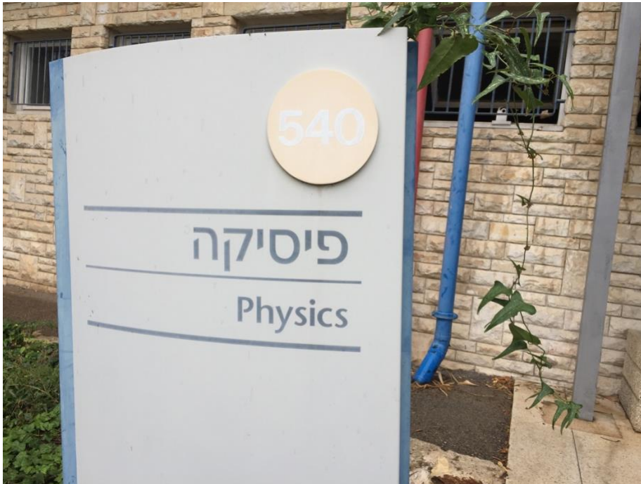
The entrance to the physics building.