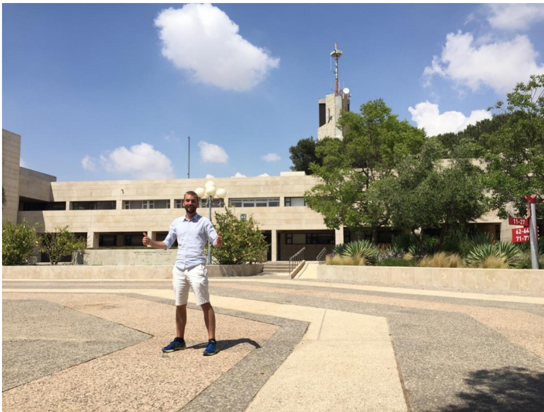
Me, excited about the Hebrew University campus despite the unrelenting Israeli sun.