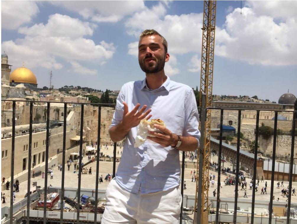
Me, enjoying a pita shawarma in front of the Western Wall.