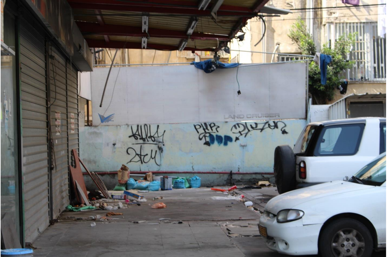
Photograph K: view of alleyway on Lewinsky street