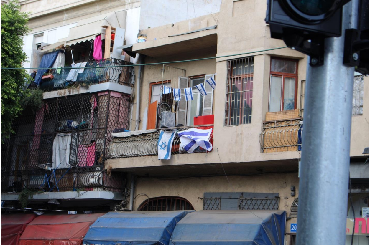
Photograph G: Balcony on Lewinsky street, series of flags and objects fill balcony.