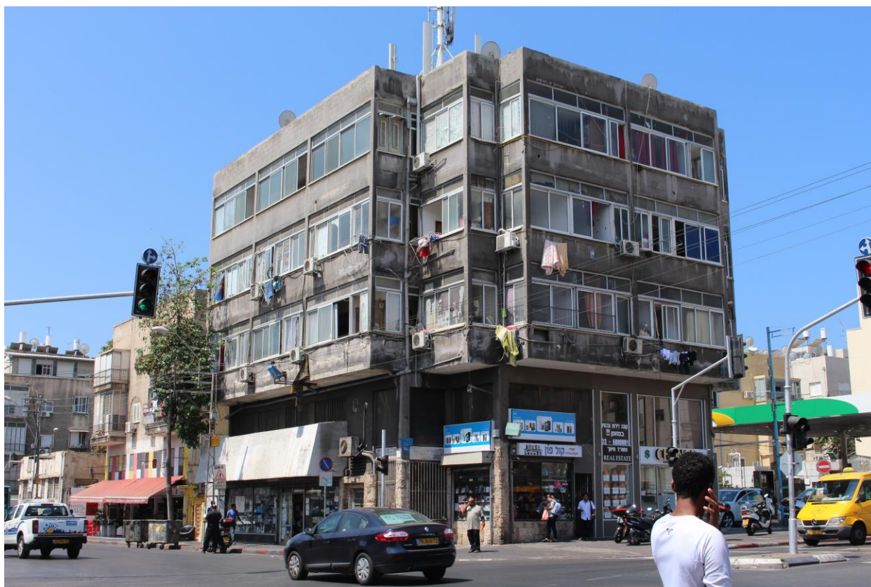
Photograph R: Photograph of Balconies on Lewinsky street