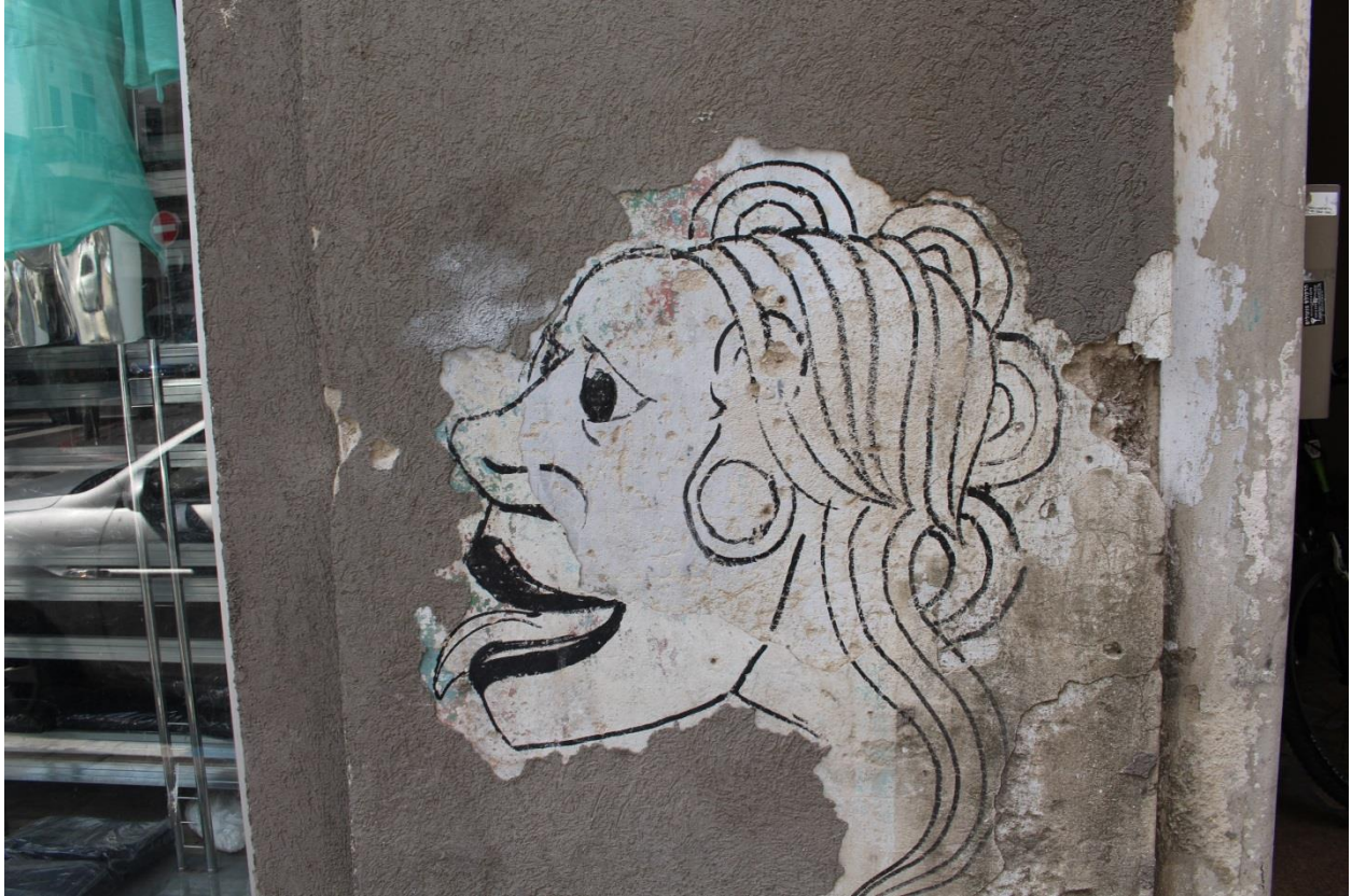
Photograph J: Graffiti seen on Lewinsky street. Rather than be used as a tool of infraction, graffiti is used to beautify a building that has begun to fall into disrepair. In effect this serves to renovate the building's exterior while simultaneously contributing to the historical and artistic space of the neighborhood.