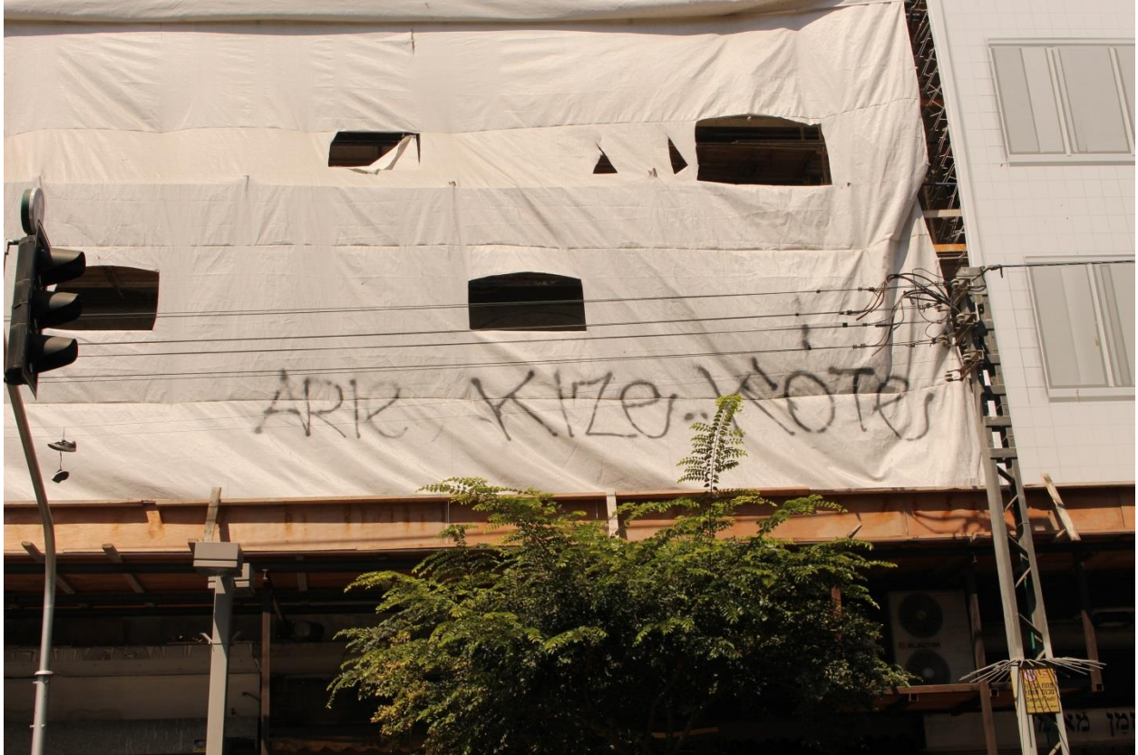
Photograph F: Side of billboard on Allenby Street. Building is currently buing renovated, This was the only part of the renovation site that had visible graffiti on it