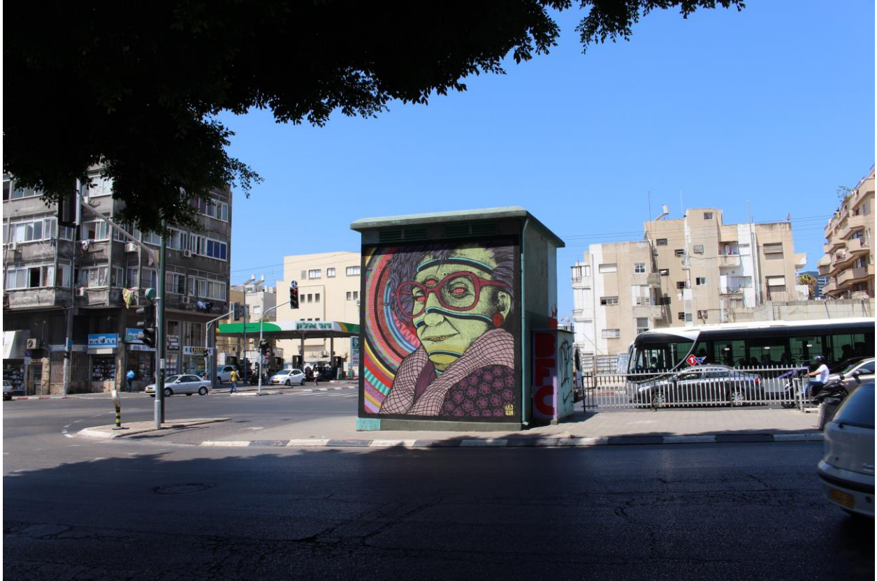
Photograph S: Graffiti on Lewinski Street