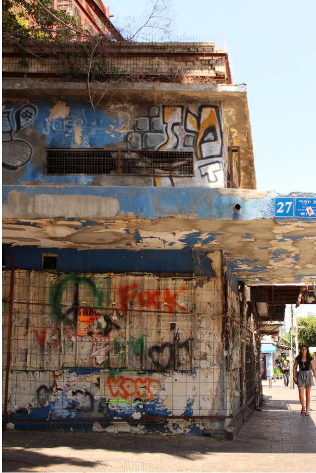
Photograph O: Picture of graffiti on 58 Allenby Street