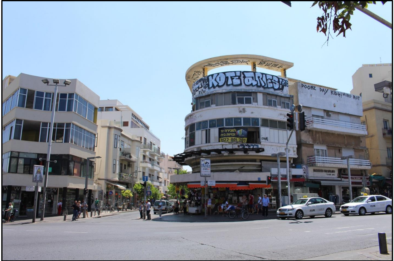
Photograph : Corner of Allenby and King George V street. Abandoned building is on the upper floor of a few shops. The building is heavily graffitied.