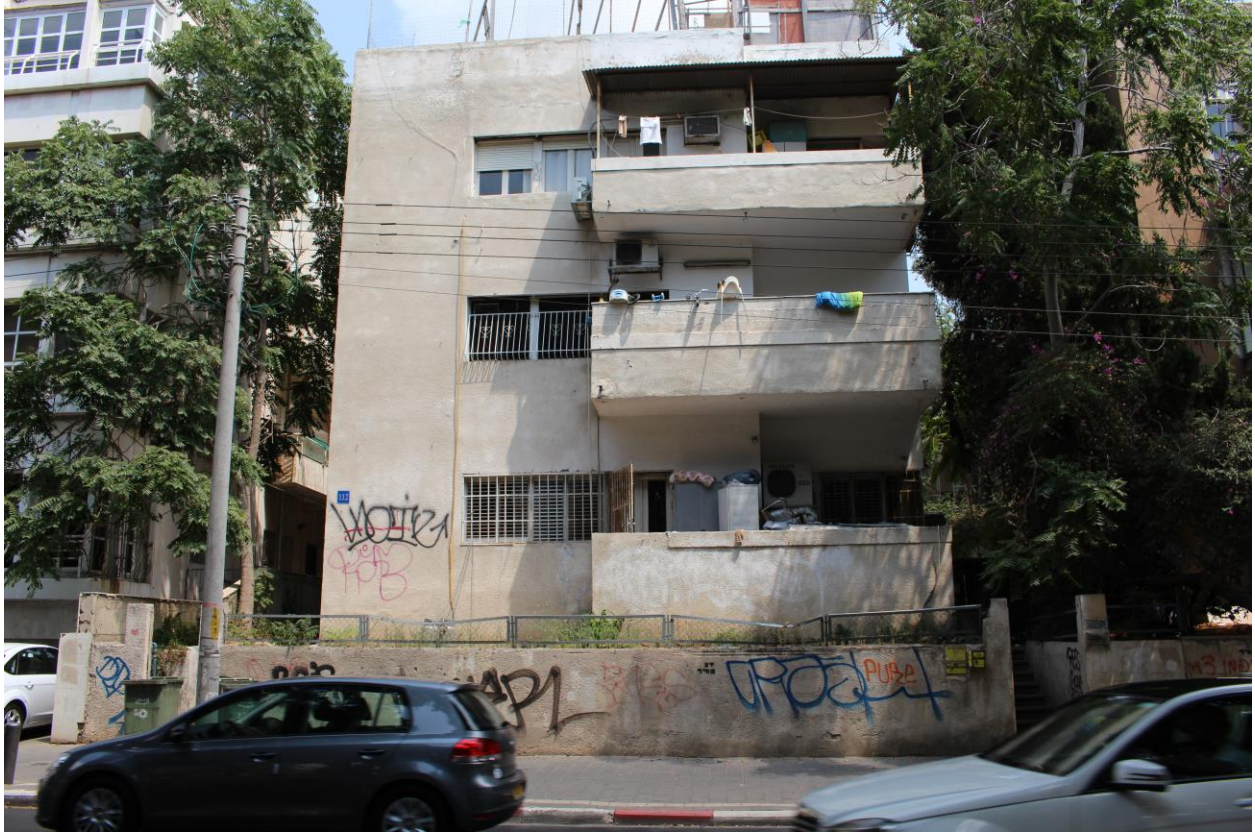
Photograph L: Rothschild Boulevard Graffiti outside of apartment homes