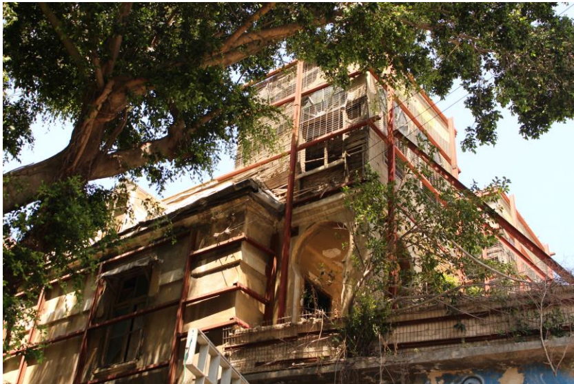
Photograph P: 58 Allenby Street, Image of full building undergoing construction