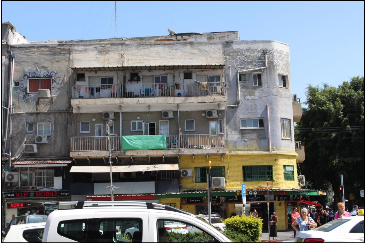
Photograph C: View of apartment buildings on allenby street. Although shops below the apartment are painted the apartments themselves retain the original color.