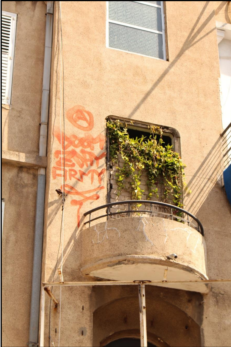
balcony on Allenby street with graffiti written on side.