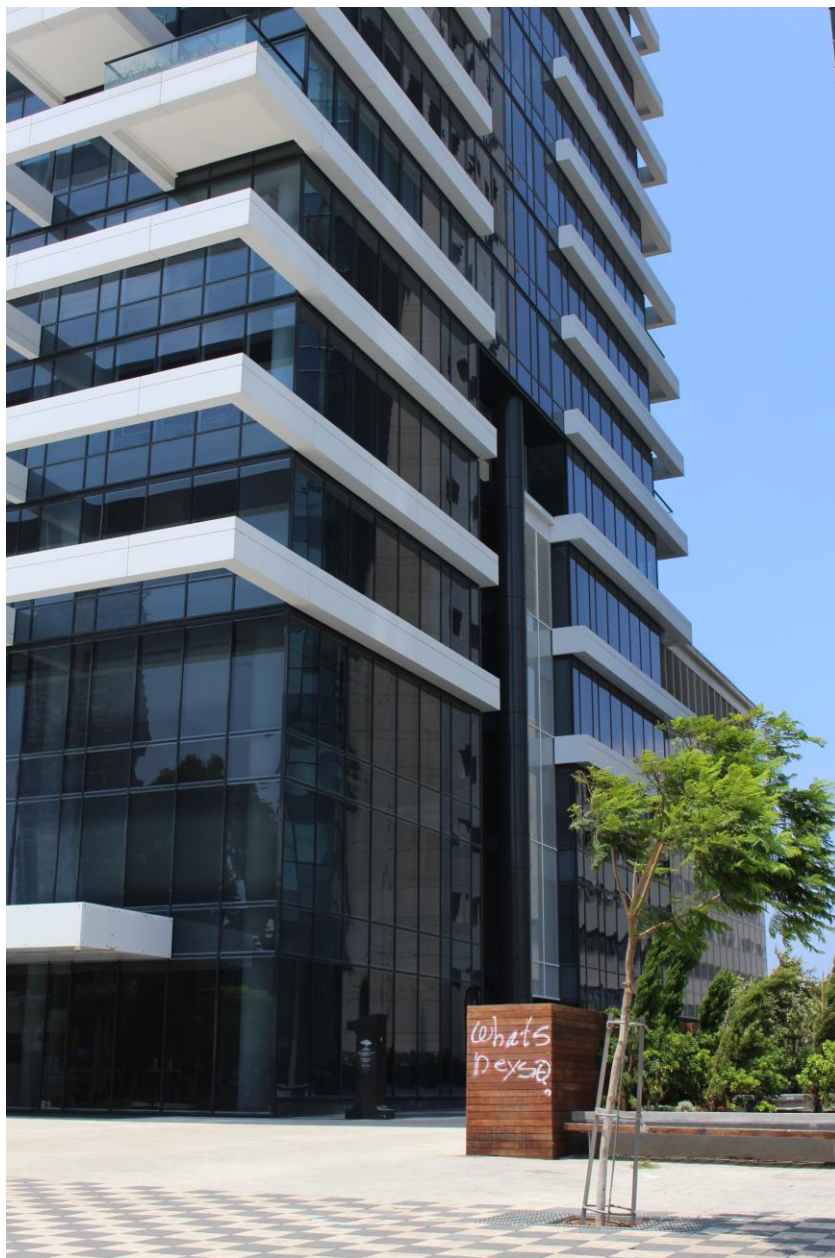
Photograph N: 1 Rothschild Boulevard with only graffiti in square in front of building.