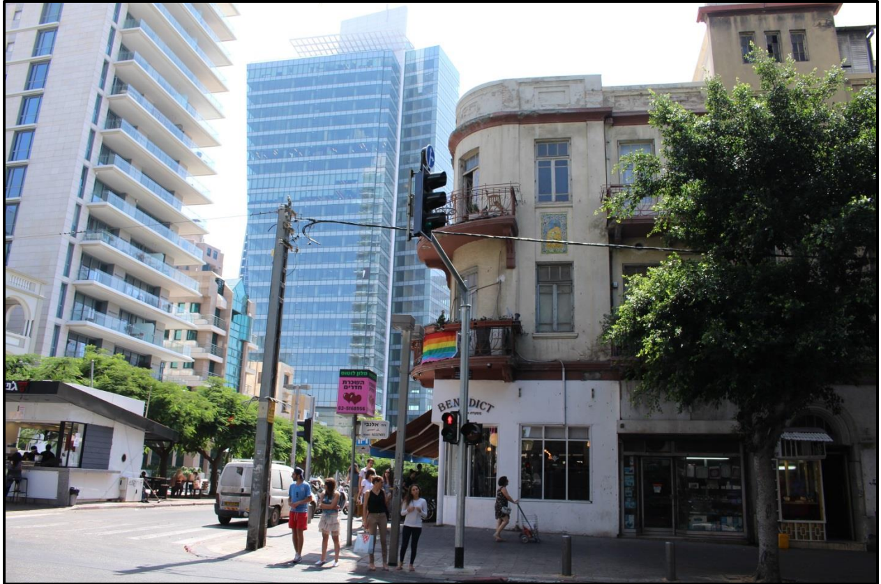
Photograph B: View of Allenby street. International style buildings in foreground and newly made skyscrapers in background. On the balcony of the older building there is a Gay pride flag. Tel Aviv is known for its acceptance of gay pride and encouragement of gay pride festivities.