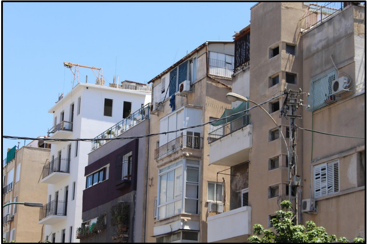
Photograph A: View of apartment buildings from Allenby Street. All buildings made in New industrial style. Newer buildings are not necessarily brand new but have simply been renovated and improved as demolition is not encouraged.