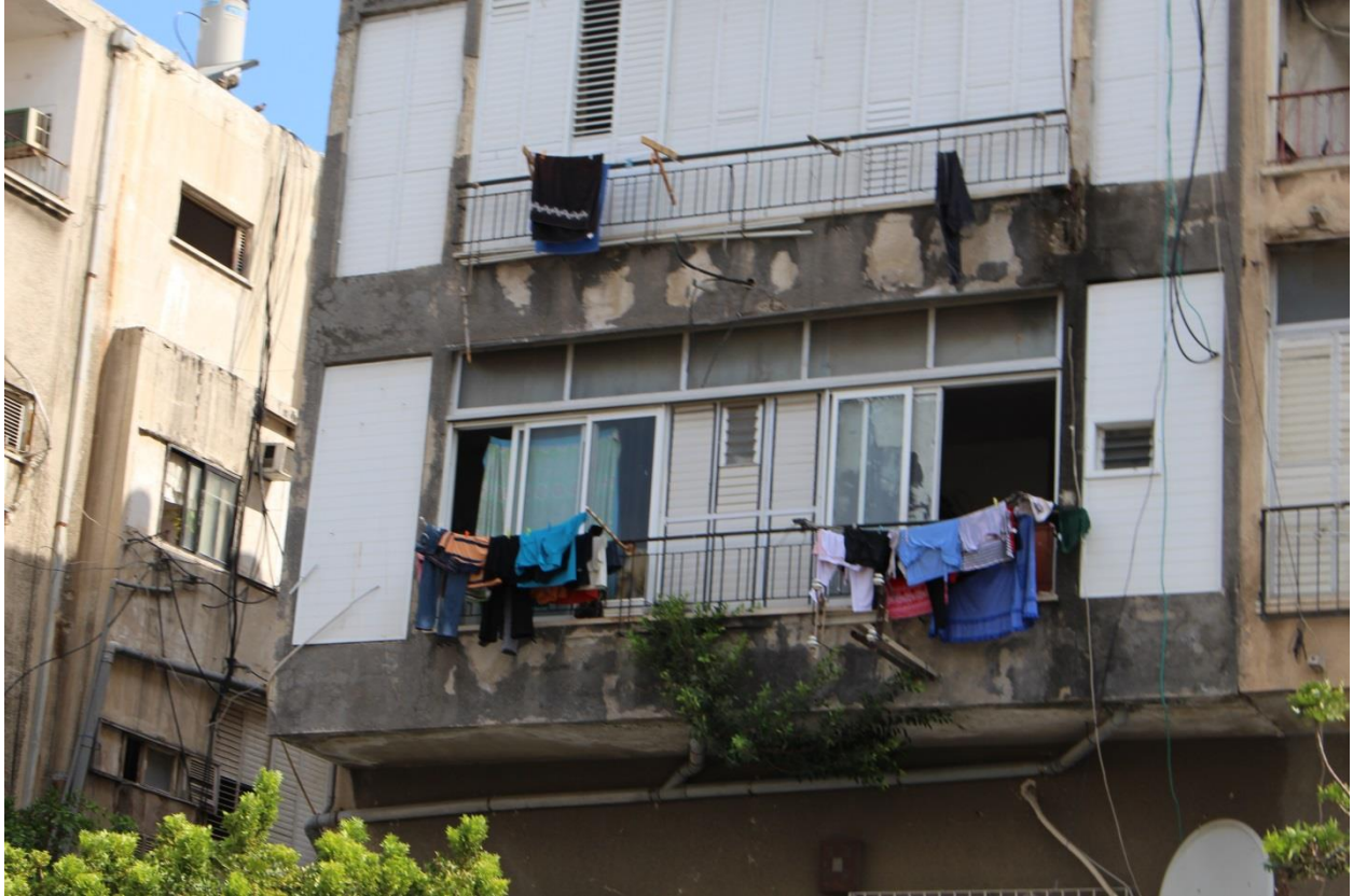
Photograph I: Lewinsky Street. Clothes Hanging from balcony