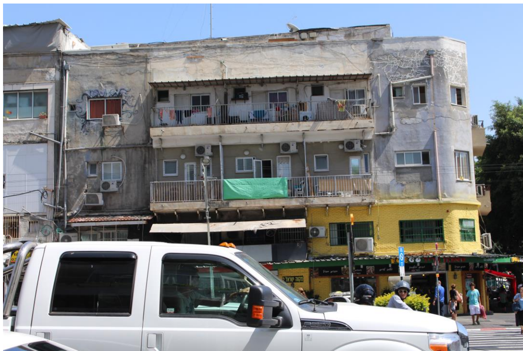
Photograph Q: Photograph of Balconies on Allenby Street