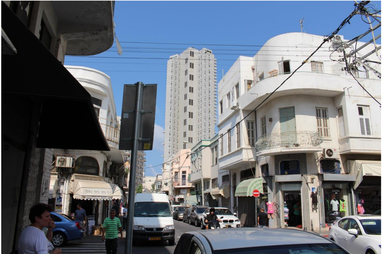
Photograph H: General view of Lewinsky street. International style in foreground and new apartment skyscraper in background.